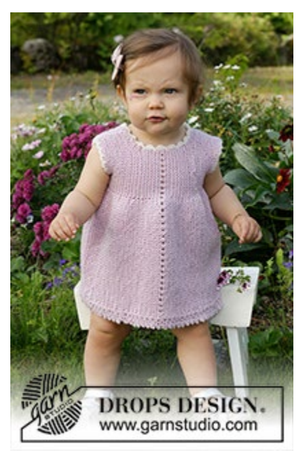
DROPS Baby 38-3

CROCHET HOOK SIZE 3.5 mm - for edges. Needle size is only a suggestion! If you have too many stitches on 10 cm switch to a larger needle size. If you have too few stitches on 10 cm switch to a smaller needle size.