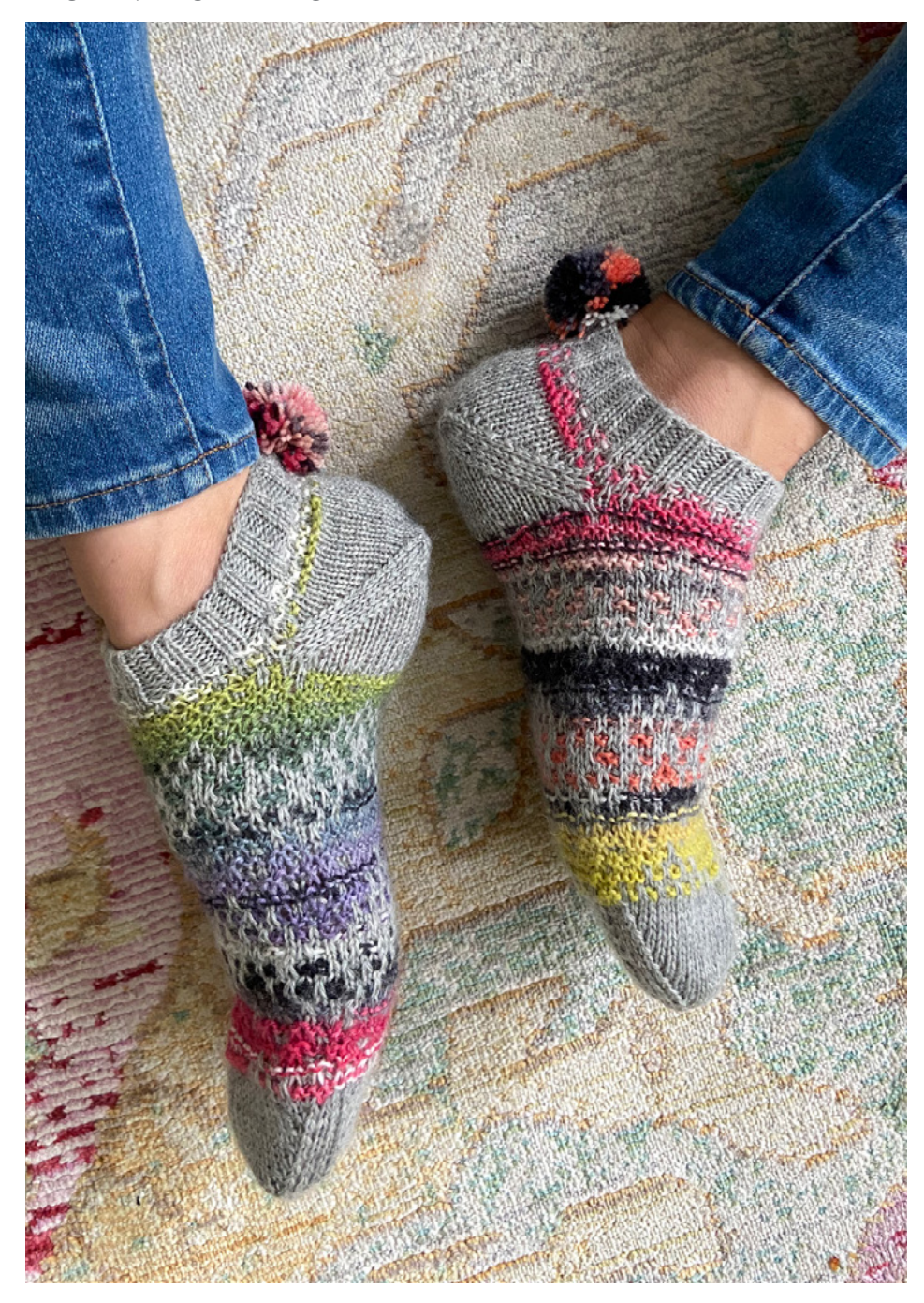
Designed by Margaux Hufnagel / Skill level: Intermediate

FINISHED MEASUREMENTS Approximately 7½" / 19 cm around foot and 9½" / 24 cm long