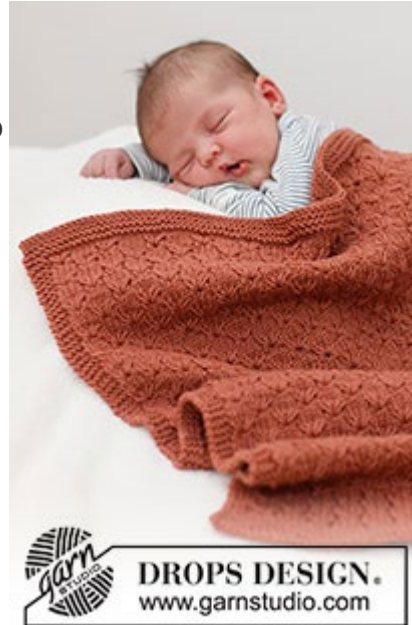
DROPS Baby 39-6

Needle size is only a guide. If you get too many stitches on 10 cm, change to a larger needle size. If you get too few stitches on 10 cm, change to a smaller needle size.